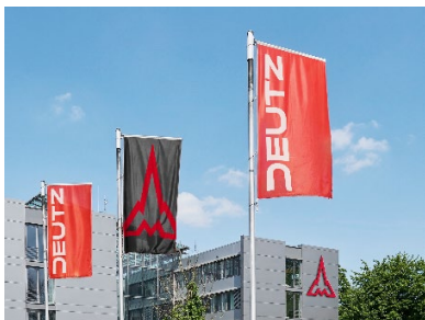
Caption: In front of the headquarters, the flags fly in the new design.