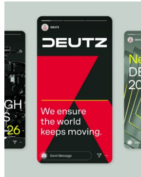
Caption: A strong presentation on mobile, too, in the new branding.