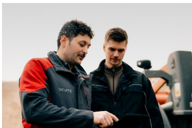
Caption: A DEUTZ service technician with the new logo on his workwear.

All images are ready to be downloaded on https://www.deutz.com/en/news/press-releases/