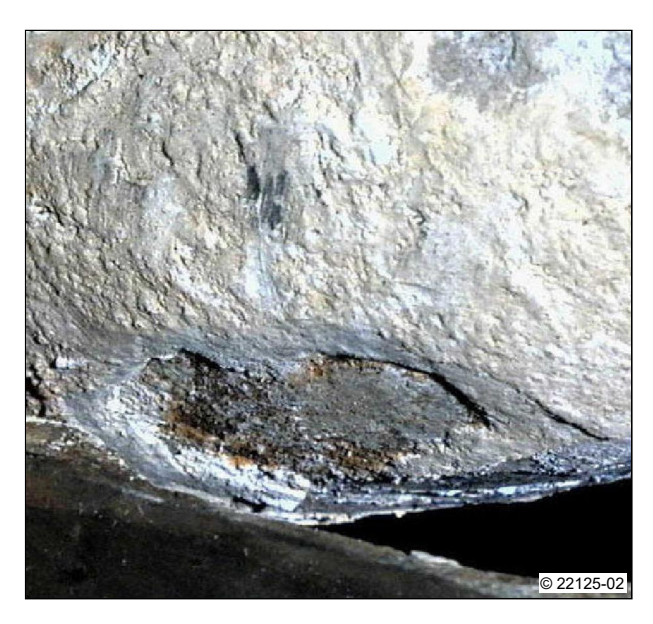
A13: Limescale deposits on a cylinder liner