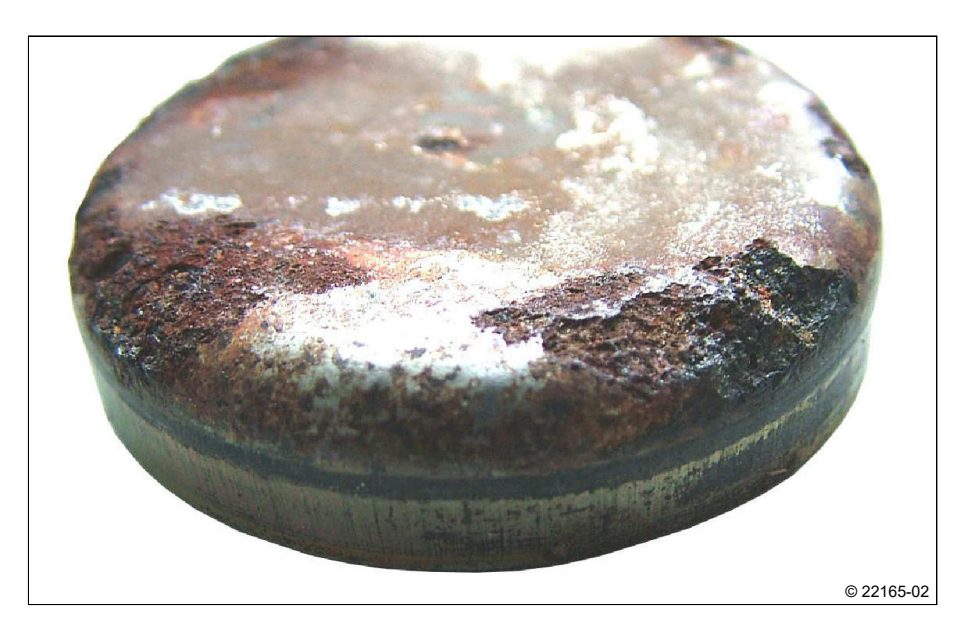
A11: Sealing cover, corroded