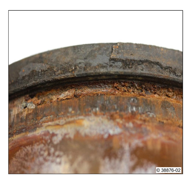
A5: Cylinder liner