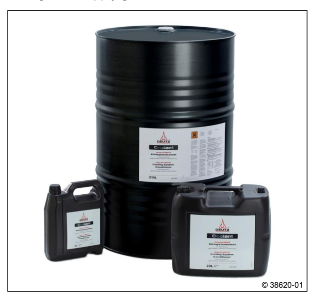
A1: Original DEUTZ cooling system protective agents