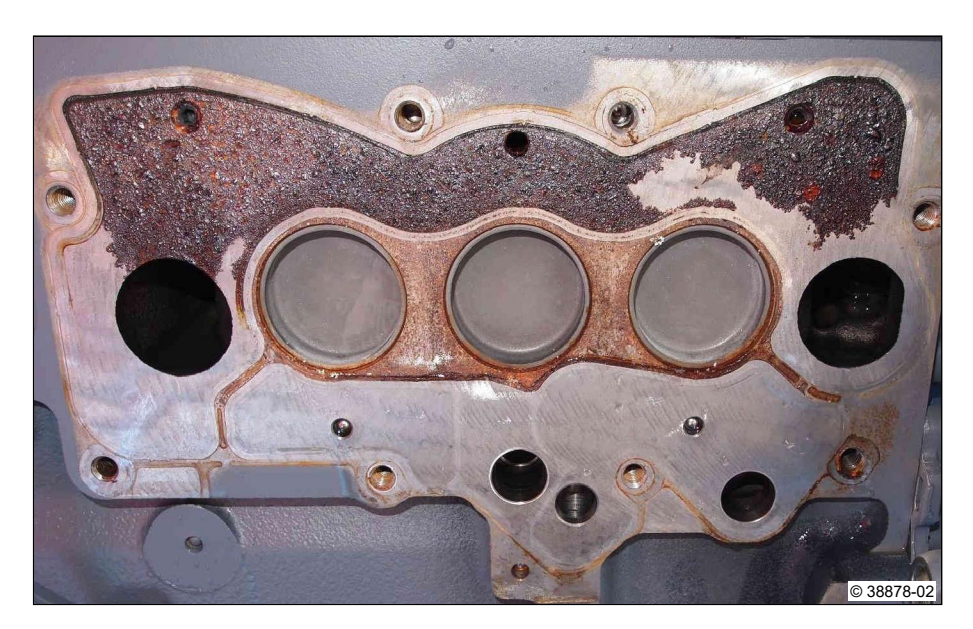
A7: Crankcase in the area of the lubricating oil cooler housing