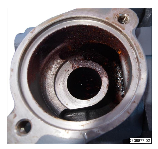
A6: Thermostat housing