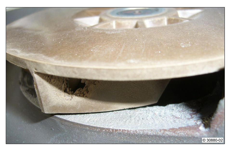
A15: Flywheel of the coolant pump, cavitated