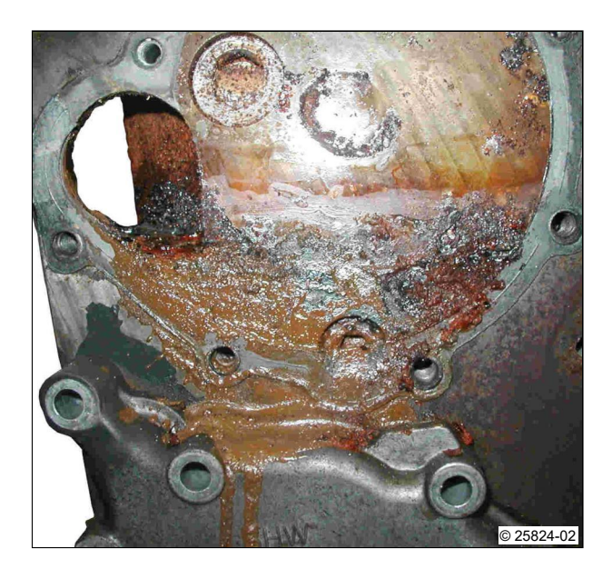
A9: Coolant pump seat on the crankcase