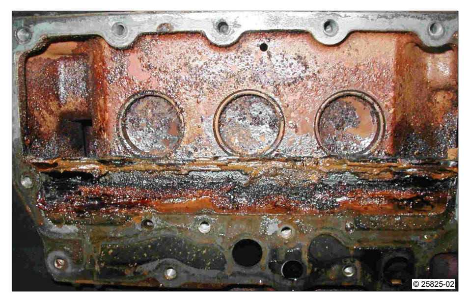
A8: Crankcase in the area of the lubricating oil cooler housing