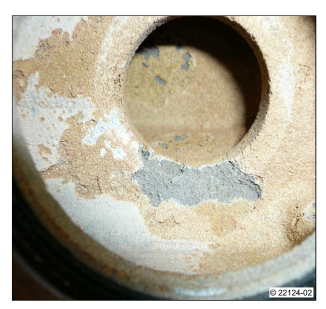
A12: Aluminium thermostat cover, corroded