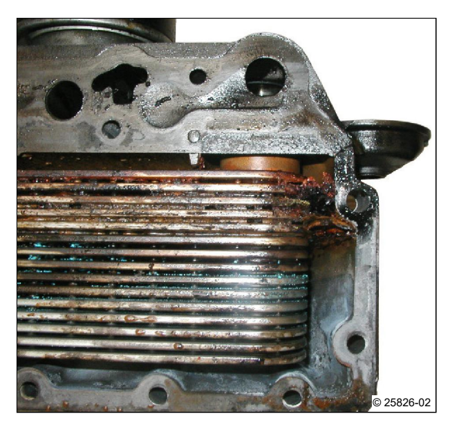
A10: Lubricating oil cooler housing