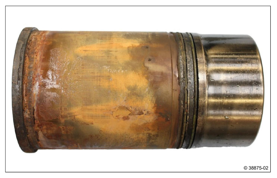
A4: Cylinder liner